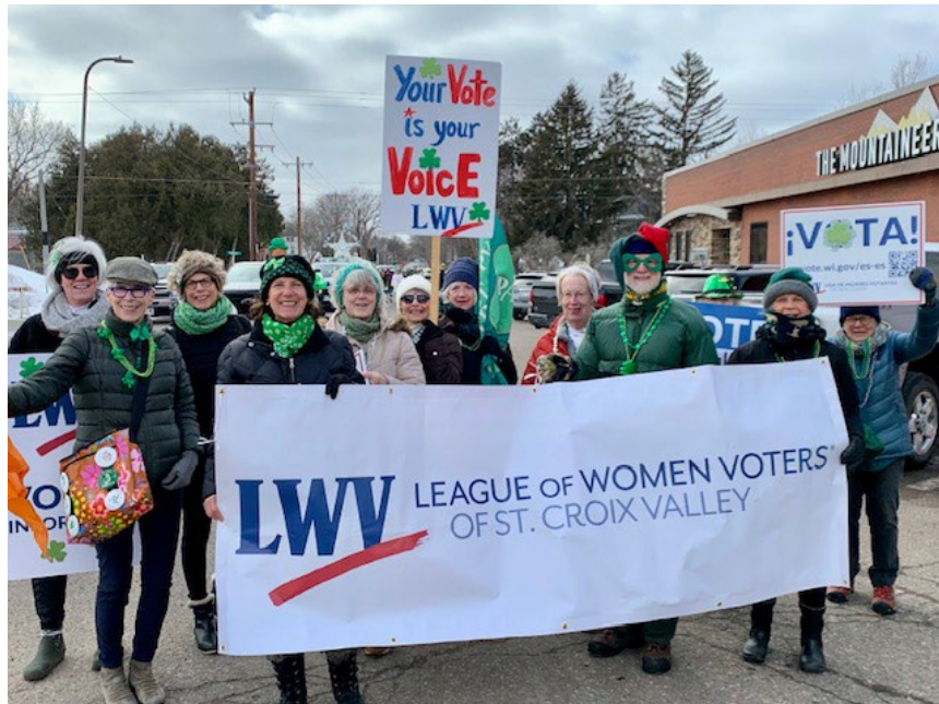
League members march in New Richmond on St. Patrick's Day