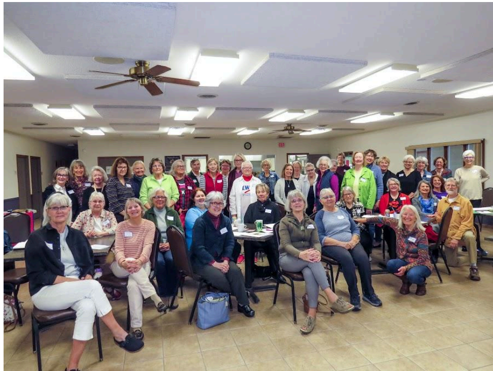
Great turn-out for Annual Meeting 2024